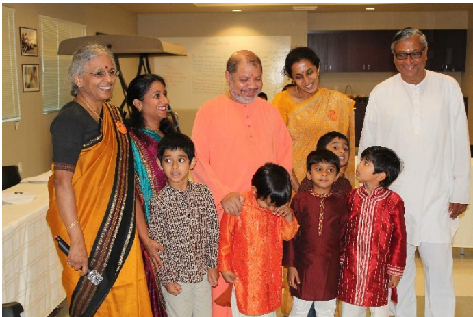
Grade PK- Shishu Vihar