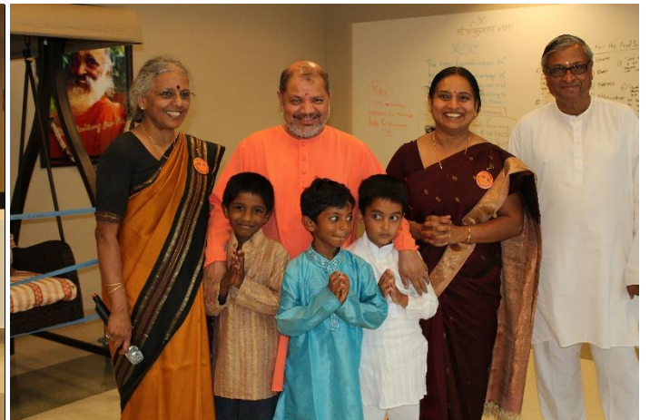
Grade K- Bala Vihar