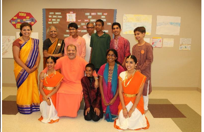
Grades 1-8 Bala Vihar (From left to right)